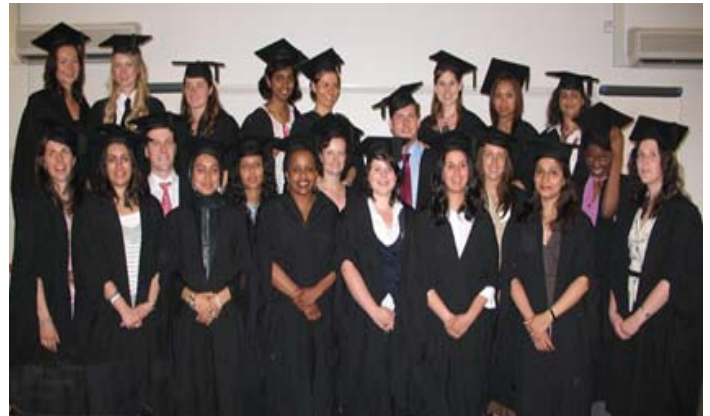
2005/06 LDBS SCITT GRADUATES ~ 7 TH JULY 2006 ↑

T he London Diocesan Board School Centred Initial Teacher Training (SCITT) course began in 1999 and is now in its 7 th year of training high quality graduates to become successful, confident and effective teachers. The SCITT is solely based in Church of England primary schools so the trainees have a unique opportunity to work in a Christian environment, teaching children from a wide range of multi ethnic and multi cultural backgrounds. Congratulations to all of our trainees on their success and we wish them well as newly qualified teachers.