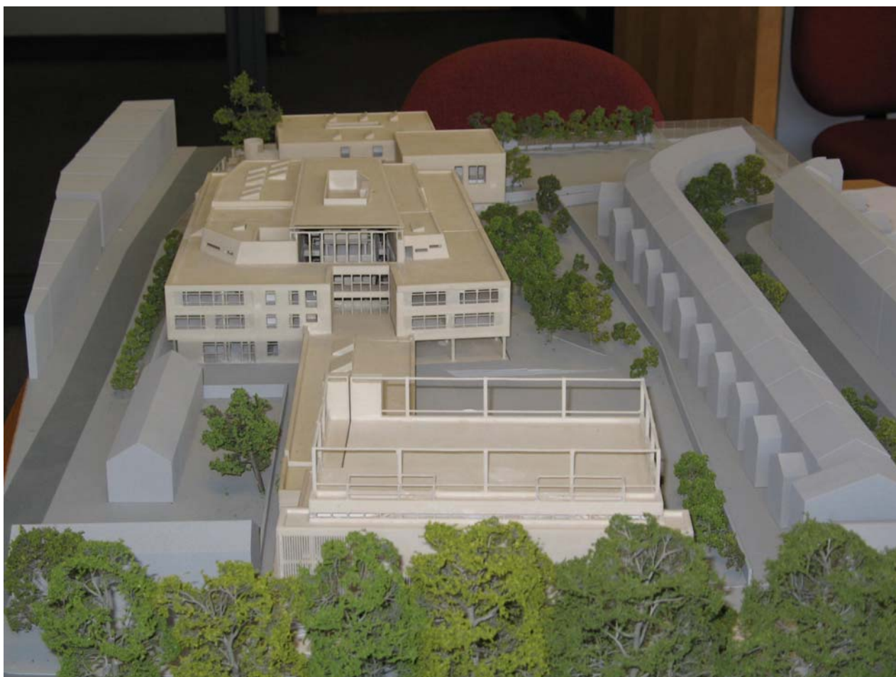
↑ MODEL OF ST MARY MAGDALENE ACADEMY

For more information please go onto the SMMA website: http://www.smmacademy.org/