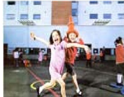
↑ SONG AND DANCE

GREAT ATTENTION PAID TO THE HEIGHT OF THE WINDOW ← SILLS