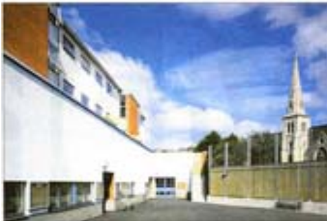
↑ THE NEW OUTSIDE SPACE AT ST JUDE & ST PAUL'S

St Jude and St Paul's have come up with an innovative project where 24 smart 1 st floor flats in a 4 storey block have been built above the school run by the Islington and Shoreditch Housing Association. The architects believe it is the first example in the U.K. of a school with housing above and was designed from the outset with the sensitivities of all its occupants in mind. The school and flats have separate entrances/exits and every detail, from kitchen window sills to the height of balconies has been carefully thought out. The result is that, whereas many inner-city schools are over looked by high-rise flats, St Jude and St Paul's is unusually secluded, despite sharing the same patch of land with 2 dozen homes.